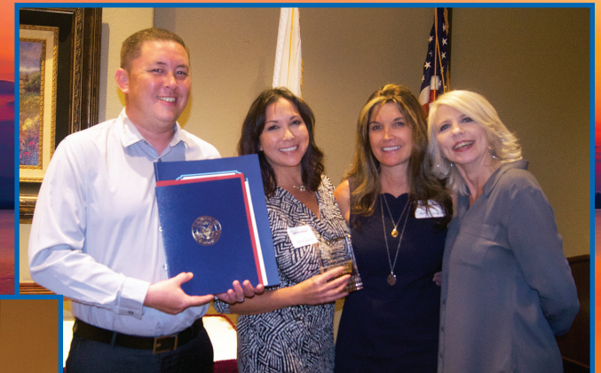
Left to right: Heritage Candy Company and New Indy triPAQ were honored with Outstanding Partnership awards at the Eighth Annual Inland Empire Caucus Partnership Recognition Event. Thank you for your exceptional support!

VIP clients earned an impressive $6.4 million in 2019! Thank you to the hundreds of business partners who promote diversity and provide exceptional opportunities to enable persons with disabilities to learn new skills, gain valuable experience, and succeed in their careers. VIP is proud of the collaborative efforts to provide quality employment services to all its stakeholders.