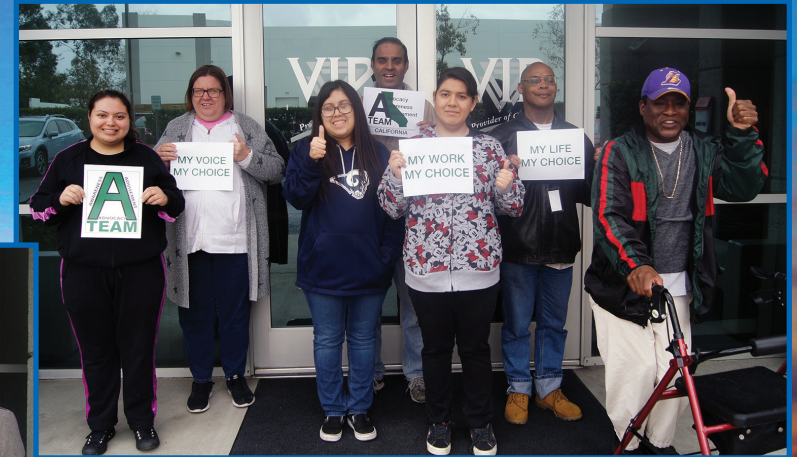
Left: VIP hosted the Rancho Cucamonga Rotary Club meeting in March. Community leaders toured VIP's Production Facility and were able to experience first hand the awesome capabilities of VIP's clients.

Below: VIP and the ACE Program started the first A-TEAM California chapter. Each VIP location meets monthly to discuss advocacy and a person's right to CHOICE! More than 100 VIP clients are members of this national advocacy group.