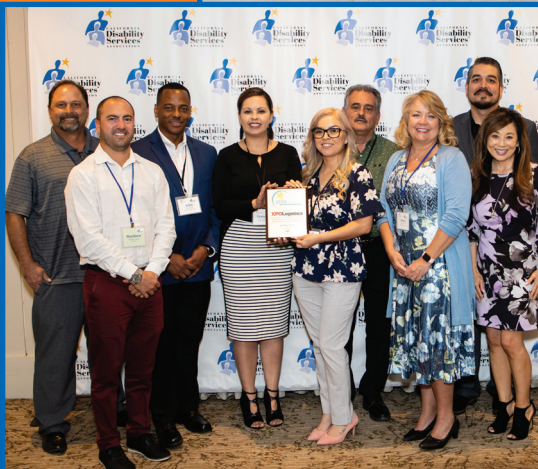
Left: VIP Directors were excited to celebrate as XPO Logistics, Inc. received a Star Award at California Disability Services Association's Annual Meeting in Pasadena. Star Awards were presented to partners that provide outstanding support for persons with disabilities.